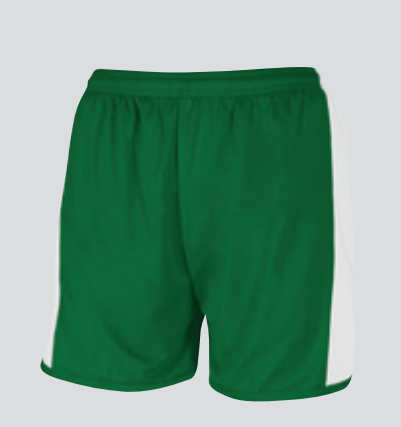
GM RELIANT SHORT $15 (Blank) PG 46