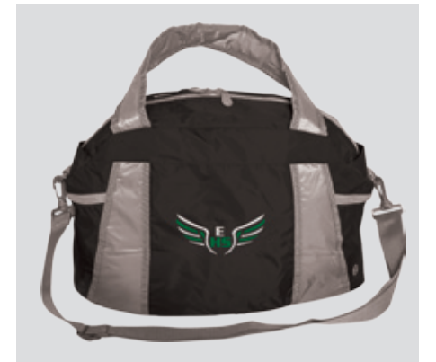
CRUISE DUFFLE BAG $28 (Blank) CALL FOR DETAILS