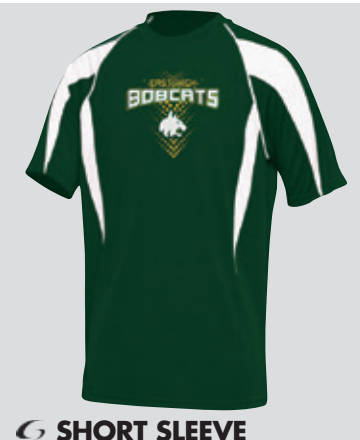
PARAMOUNT PLUS TEE $22 (Blank) PG 29