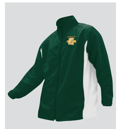
G TRAINER WARM-UP JACKET $20 (Blank) PG 6