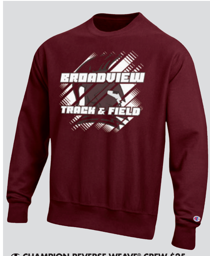
CHAMPION REVERSE WEAVE® CREW $25 (Blank) PG 23