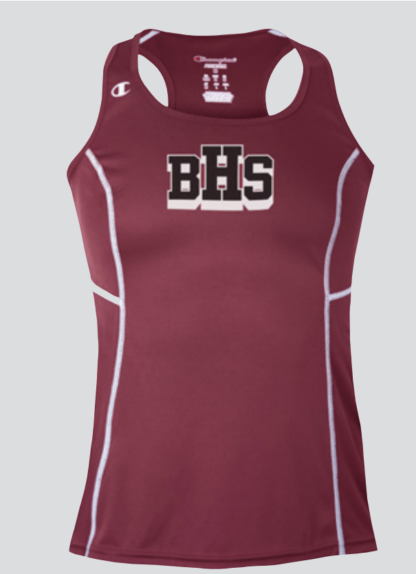
C CHAMPION RACEDAY SINGLET $16 (Blank) PG 47